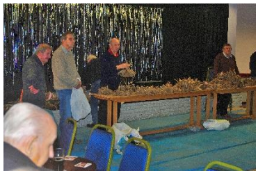
Tuber sale – 40 people attended.

We had an excellent Tuber sale, followed by a successful plant sale in May. Both require lots of effort and support – both tubers and plants to raise finances for our shows. Thanks to those who provide refreshments which make the events attractive to visitors.