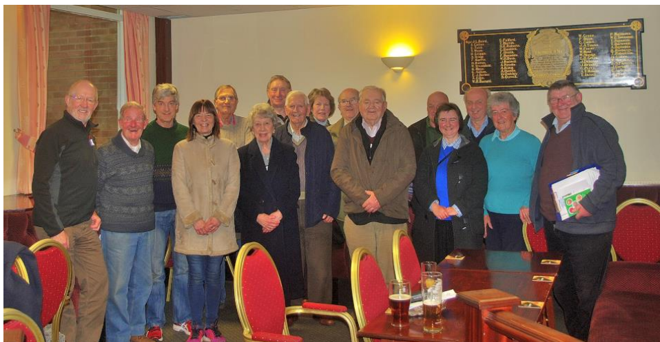
Committee members for 2018.

1 st Wednesday of every month, except September