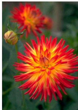
Weston Spanish Dancer