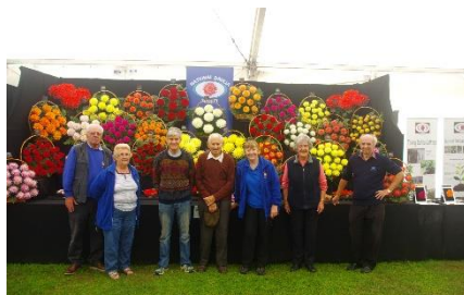
Malvern Gold Award winning team 2017

There are several fairly regular people in the team with others who can help out at times, which is a big help, as we only have a limited time available to complete the stand before the RHS judges need to evaluate the stand. A lot of the work involves fitting Oasis in baskets and vases, ready for the floral arrangements. So, the team will always welcome help with all these tasks to ensure that we continue to get RHS awards for the society. My sincere wish to all the members is 'carry on the good work to enhance the reputation of the Society'.