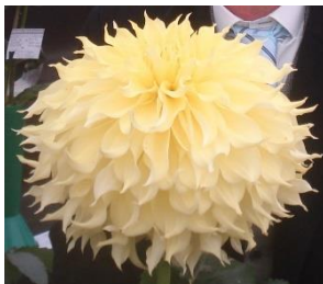
Lui White

We had two good National shows winning the Herbert Brown Cup at Wisley and coming third at the Northern National Show in Harrogate. I am sure we have a full report on both shows else were in the Midahl. Once again thanks to all who gave their time and Blooms to travel and stage the exhibit. We must congratulate the Irish Dahlia Society on the magnificent exhibit to win the Arthur Luck at Harrogate they staged three giant decoratives that stood out far and above anything else, a sport of the new giant Aggie White named Lui White both, I am told, are sports of Bryn Terfel.