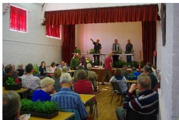
Plant sale, also well attended.