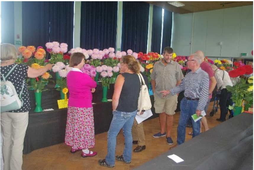
Lots of activity at the Annual Show 2017.