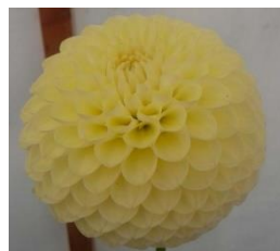
Barbarry Primrose Hall

The banker show varieties are maintaining their popularity, and very few recent introductions are making an impact. As I edited the NDS Winter Bulletin country-wide roundup, it was interesting to note that one of the most recent of new introductions – the red small decorative, Sheval Megan, had a good year and was awarded a good number of top awards. Amongst others Ryecroft Helen, the yellow medium semi-cactus is also getting established. Barbarry D'Amour – a red miniature decorative is being well used, along with Barbarry Primrose Hall in its first year, a yellow miniature ball, looking very good.