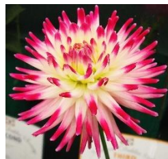
Josudi Neptune

Of the new releases in 2018, the sport of Bryn Terfel, Aggie White- a pale yellow one whose form appears better than the parent is available from Halls of Heddon. Another sport of Bryn Terfel was seen at last year's Harrogate show. Also from Halls of Heddon are Josudi varieties – Aurora, Neptune and Hercules, which will be a big boost to the miniature cactus classes. Neptune is a particularly attractive bi-colour, but tends to bloom near the foliage, so a side bud should be used.