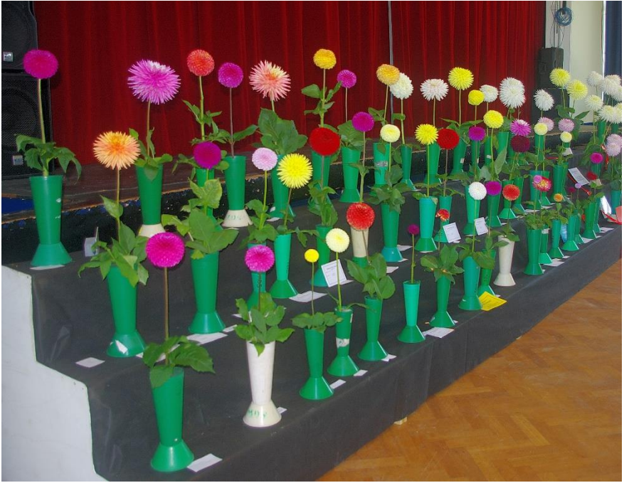
Midlands Annual Show 2017 – M Walker won the 3 bloom/ 3 vase class. The 17 entries are shown above.